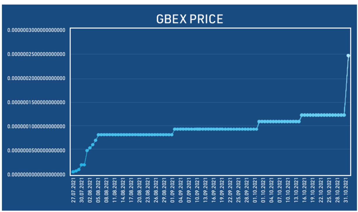
The GBEX price as of October 2021

2% will be distributed to all holders. Globiance has done everything possible to make holding and using the GBEX token as rewarding as possible for our users. Rewards come from TAX, Buy & Sell Fees, and the Staking functionality.